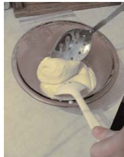
Knead the curd