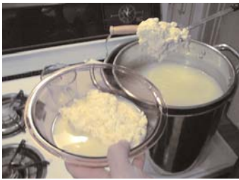
Scoop out the curd

8) Finally, microwave the curds one more time for 20-30 seconds. Remove the cheese. The cheese should be stretchy at this point. Continue to knead until the cheese is smooth and shiny. Once smooth and shiny, the cheese is ready to eat! You can keep the cheese in a tupperware type container and refridgerate or freeze.