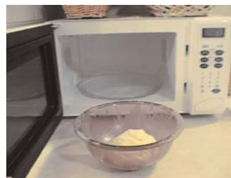
Microwave the curd