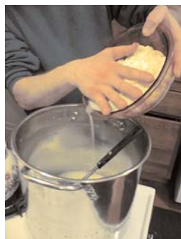
Separate the curd

5) You should now have a mass of clumps (curds) floating in a greenish colored liquid (whey). Use your slotted spoon to scoop out the curds and place them in the microwavable bowl. Try to leave as much of the liquid (whey) behind as you can. When you have gotten all of the curds out, press them into a ball. The idea is to squeeze out the liquid (whey) and retain the curds (cheese).