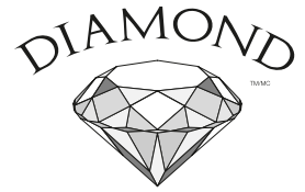
Diamond Lager Yeast vs. Cream Yeast (same strain)